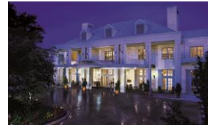
Hyatt Regency Hill Country Resort and Spa 9800 Hyatt Resort Drive San Antonio, Texas 78251 Phone (210) 647-1234

The Hyatt Company is currently undergoing a change to their reservation system, with that; they are unable to customize the language on the reservation page for our StorePoint Fashion Event. Rest assured this will not change your ability to book rooms within the StorePoint Fashion room block with our negotiated rates.